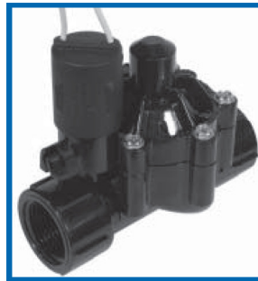
N-100 (1 in. FIP)*