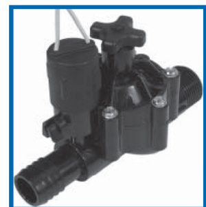
N-100MBF (1 in. MALExBARB with flow control)*