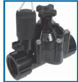
N-100F (1 in. FIP with flow control)*