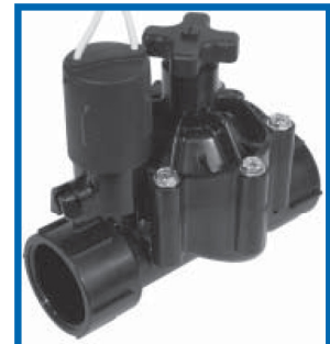
N-100SF (1 in. SLIPxSLIP with flow control)*