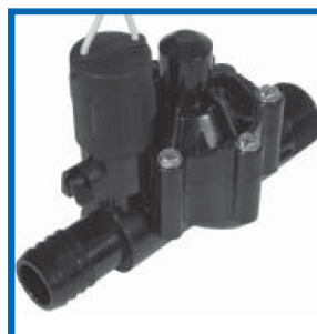
N-100MB (1 in. MALExBARB)*